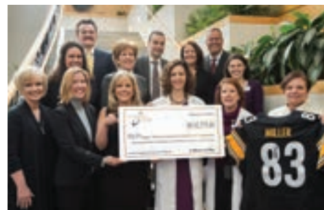
A Glimmer of Hope Foundation presents physicians and staff at Magee with a check to support breast cancer research and clinical care.